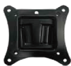
Vesa Mount (Optional)